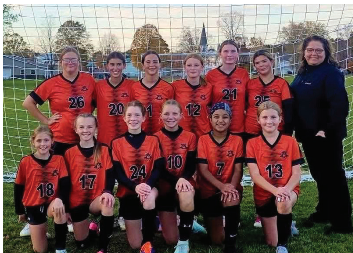
Modified Lady Olympians